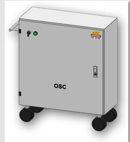
OSC System View