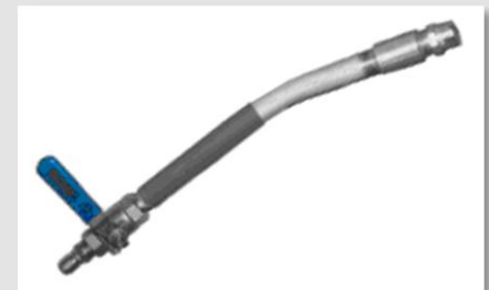
Fan Spray Wand View